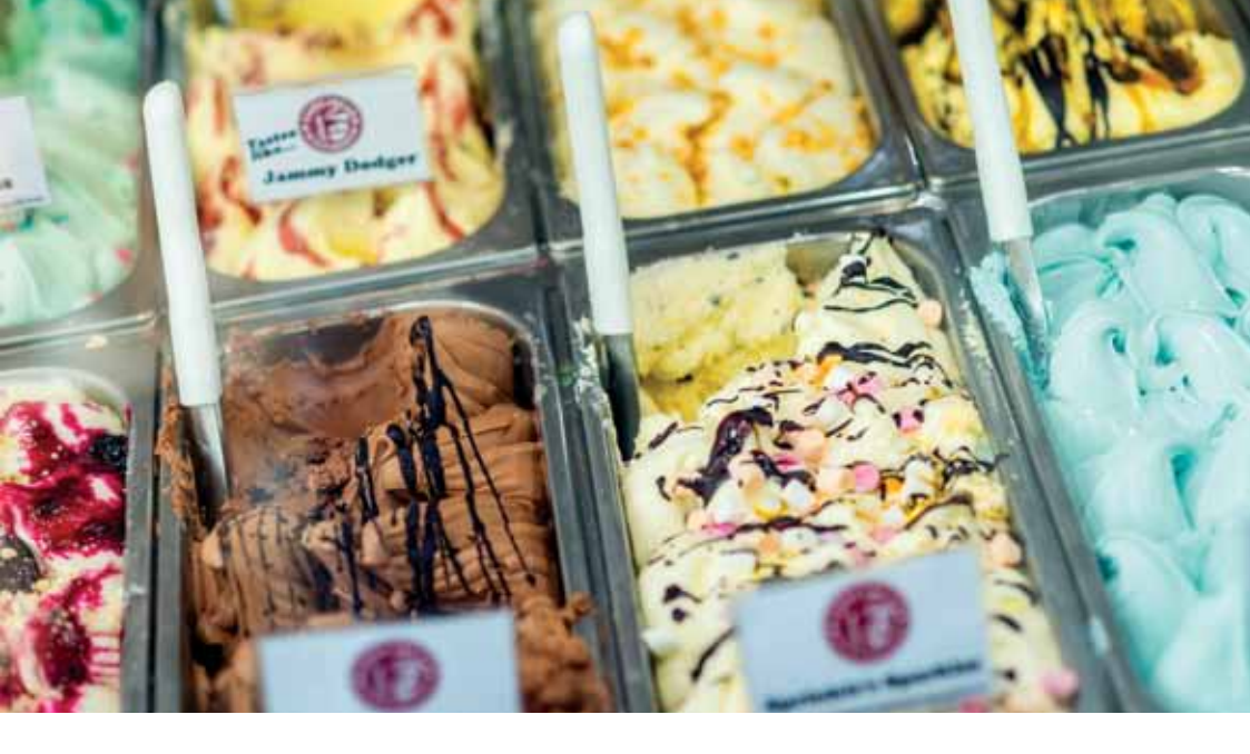
Caffe Cream Marine Point, New Brighton, Wirral Ch45 2PB www.caffecream.co.uk

Award-winning Caffe Cream is situated on the waterfront at New Brighton's Marine Point development. This is the ideal rest stop after a stroll along the promenade.